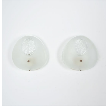
Max Ingrand for Fontana Arte, Pair of Chiseled Thick Glass Sconces, Italy, 1960