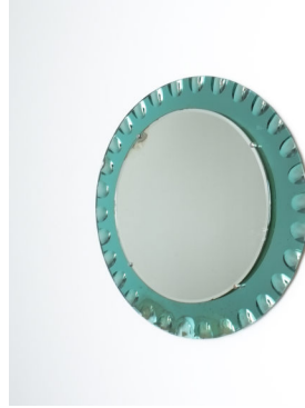
Fontana Arte Attributed Wall Mirror Green Glass, Midcentury Italy