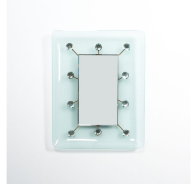
Max Ingrand Illuminated Fontana Arte Mirror, Italy, circa 1960