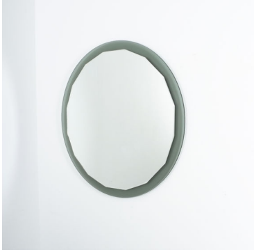
Scalloped Round Italian Mirror, circa 1970