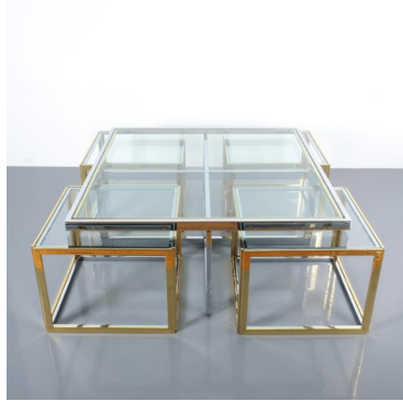
Maison Charles Square Segment Bicolor Brass Glass Coffee Table, France 1975