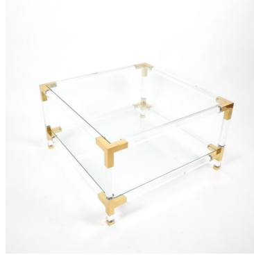
Maison Jansen, Paris Lucite and Brass Coffee Table