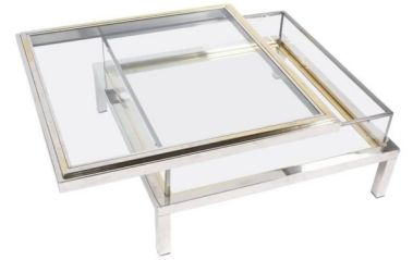
Maison Jansen Coffee Table With Interior Display