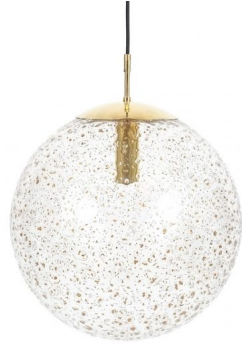
Limburg Glass and Brass Pendant Lamp Light, Germany 1960