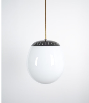
Stilnovo Large Ball Pendant Lamp Opal Glass, circa 1950