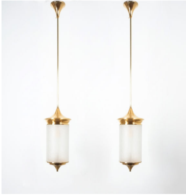
Chinoiserie Pair of Pendant Lamps Brass Glass, circa 1950