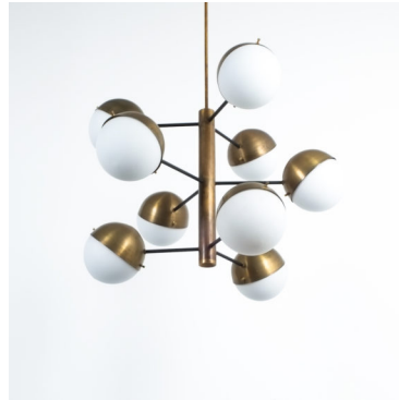
Stilnovo Mid Century Brass Opaline Glass Chandelier, Italy