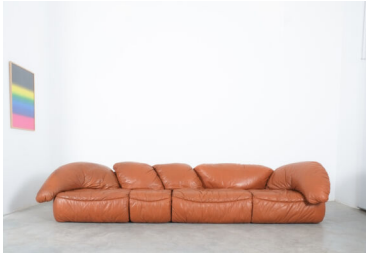
Wiener Werkstätten Sectional Sofa Group Brown Leather Croissant, Austria 1970