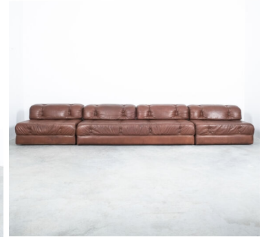
Wittmann Atrium Sofa and Two Chairs Brown Leather, Austria