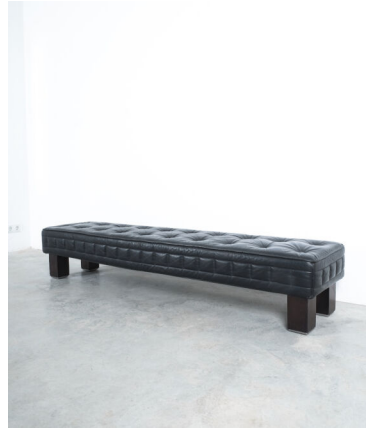
Matteo Thun One of Three Tufted Leather Banquettes Bench Materassi, Wittmann