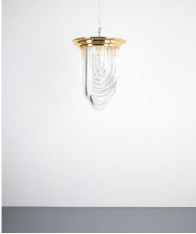
Venini Curved Crystal Glass Gilt Brass Flush Mount Lamp, Italy 1960