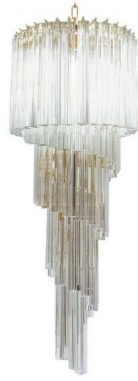
Venini Chandelier with Murano Prisms