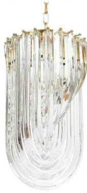
Venini Crystal Glass Gilt Brass Chandelier