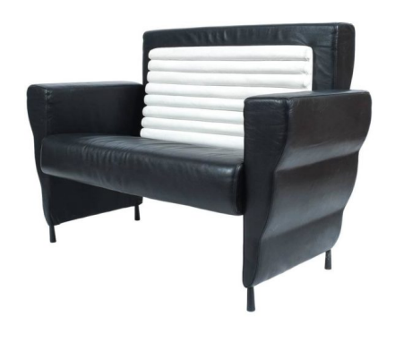
Ugo La Pietra Leather Sofa Flessuosa, 1985