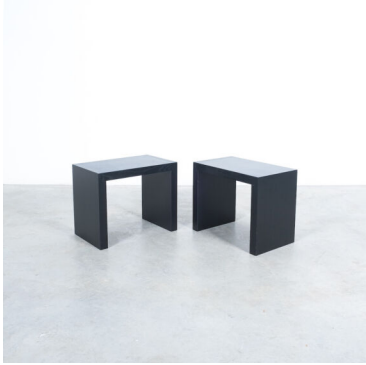
Black Oak Tables Solid Wood, France, circa 1970