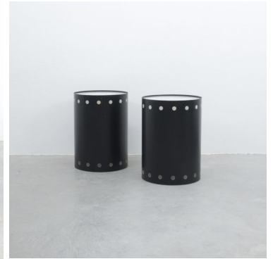
Staff Black Bed Side Tables with Lamps, Germany, circa 1965