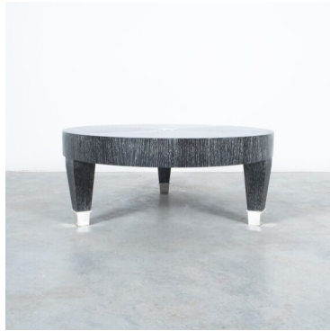
Cerused Oak Coffee Table Black Silver, Italy, 1980