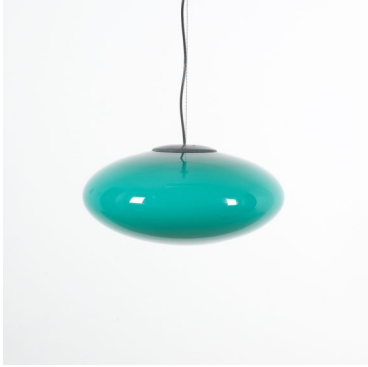
Stilnovi Green Glass Ball Pendant Lamp, Midcentury Italy