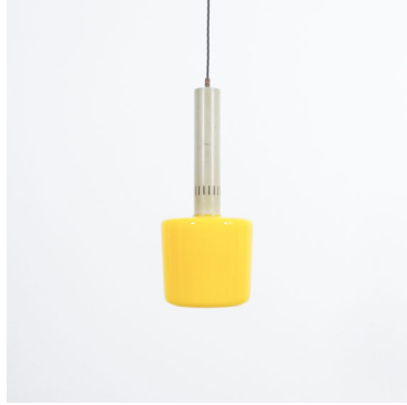
Stilnovi Yellow Glass Pendant Lamp Glass, circa 1950