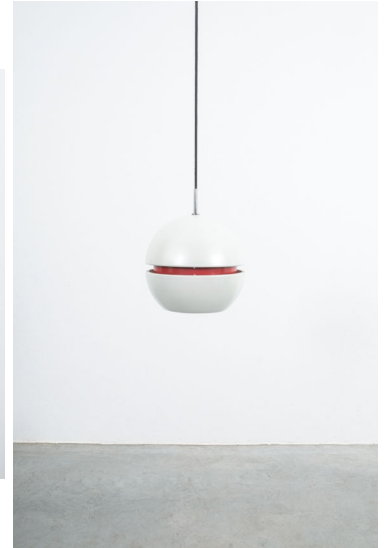
Stilnovi Pearl White Red Globe Pendant Lamp, circa 1965