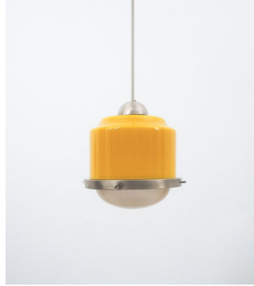
Stilnovi Yellow Glass Pendant Lamp Glass, circa 1950