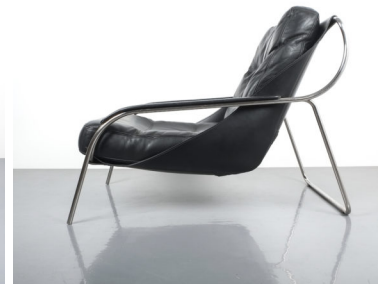
Marco Zanuso Maggiolina Sling Black Leather Chair by Zanotta, 1947