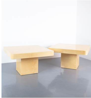
Aldo Tura Pair of Tan Parchment Coffee or Side Tables, Italy, 1970