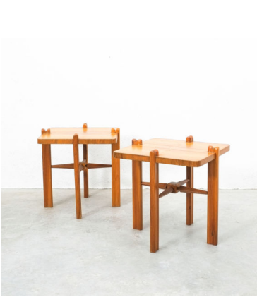
Austrian Walnut Side Tables, circa 1955