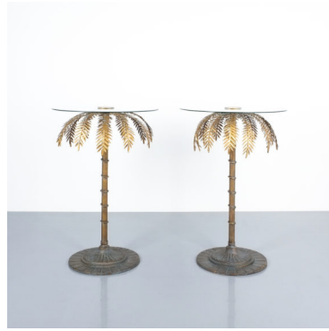
Maison Charles Style Iron Centre or Side Tables, circa 1955