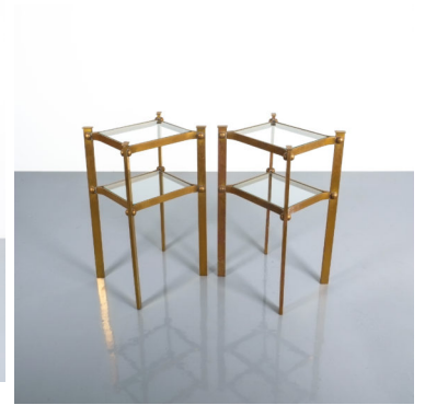
Cute Brass Side Tables With Glass Tops, France 1940