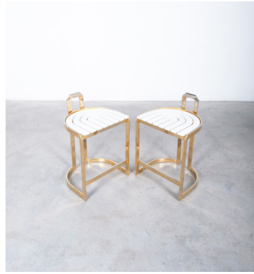
Bar Stools Midcentury From Steel and Wood White Gold, Italy