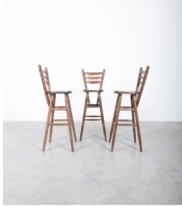
Rustic Bar Stools Midcentury from Birch Wood, Germany, 1970