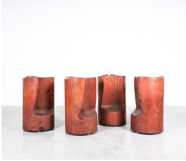
Riva 1920 Swedish Stump Wood Chairs Stools, Italy, circa 1990