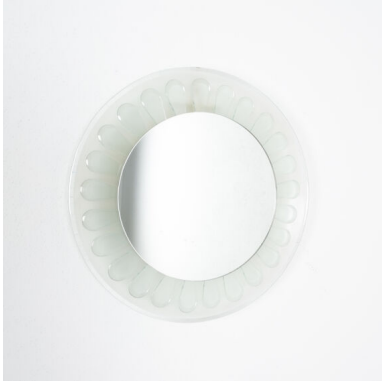
Max Ingrand Mirror Fontana Arte Round Illuminated Flower, Italy, circa 1964