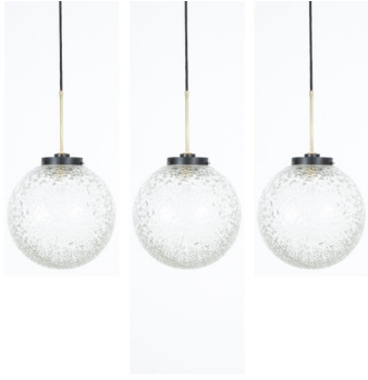
BAG Turgi Multiple Glass Brass Globe Pendant Lamps, circa 1960