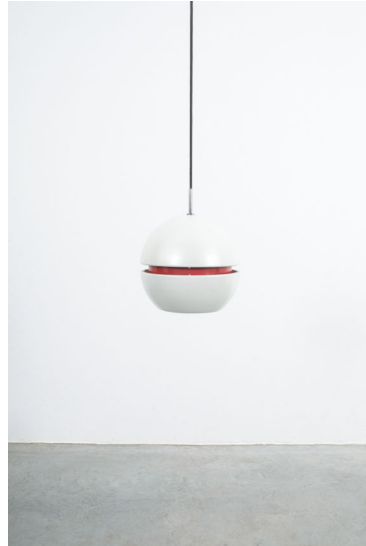
Stilnovi Pearl White Red Globe Pendant Lamp, circa 1965