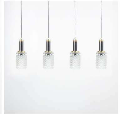
Stilnovi One of Four Stilnovi Pendant Lamps Opal Glass, circa 1950