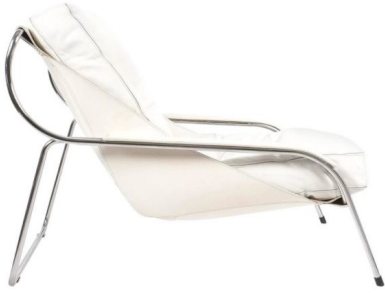
Marco Zanuso Maggiolina White Leather Chair by Zanotta, 1947