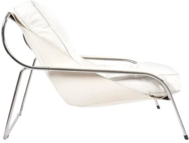
Marco Zanuso Maggiolina White Leather Chair by Zanotta, 1947