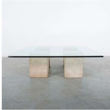
Vignelli Massive 4 Block Travertine Glass Coffee Table, circa 1970