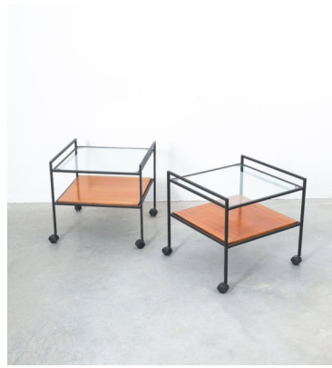
Side Tables Pair of Glass Wood Iron Tables, Italy, 1960