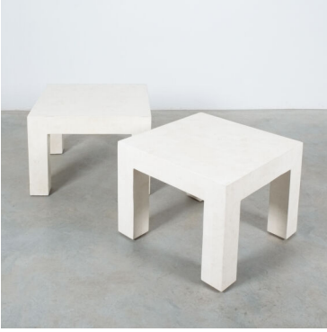
White Marble Tiles Side Tables, France, circa 1970