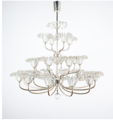
Emil Stejnar Set of Three Chandeliers Silver Glass, Austria