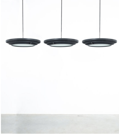
Lumi Set of Three Ceiling Pendants Black Satin Glass, Italy, circa 1960