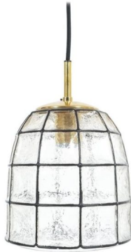
Iron Glass Pendant by Limburg, 1960