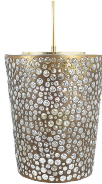
Limburg Bronze and Glass Pendant, 1960