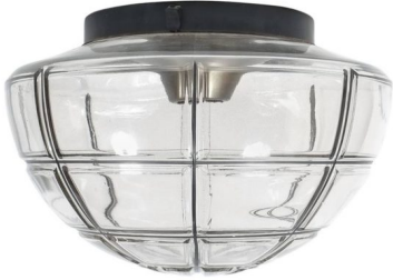
Iron and Clear Glass Flush Mounts by Limburg