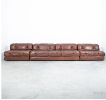
Wittmann Atrium Sofa and Two Chairs Brown Leather, Austria