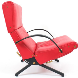
Osvaldo Borsani P40 Chair Tecno, Italy 1950