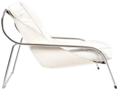
Marco Zanuso Maggiolina White Leather Chair by Zanotta, 1947