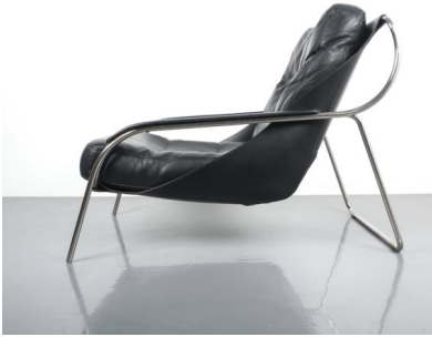
Marco Zanuso Maggiolina Sling Black Leather Chair by Zanotta, 1947