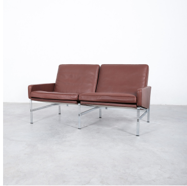
Fabricius & Kastholm Lounge Sofa FK 6720 Leather for Kill International