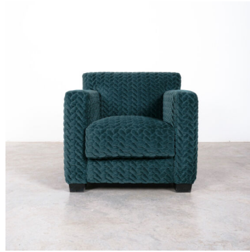
Jean Michel Frank Lounge Armchair And Ottoman Velvet, 1932