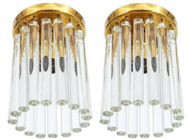
Flush Mounts Brass and Glass by Kalmar