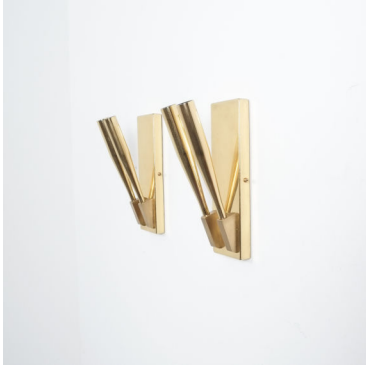
Gio Ponti Attributed Brass Wall Lights Sconces Mid- Century