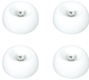
Achille Castiglioni Set of Five Glass Flush Mounts Lamps, Italy, 1960