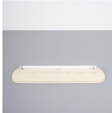
Gino Sarfatti Attributed Flush Mount for Arteluce 3006, Italy 1953