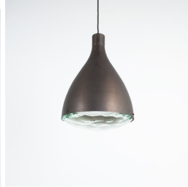
Max Ingrand Fontana Arte Pendant Lamp Mod. 2220 Glass Brass, Italy, 1962