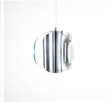
Fontana Arte Pendant Lamp or Chandelier From Curved Glass And Chrome, Italy 1965