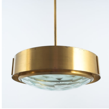
Max Ingrand Brass Glass Pendant Lamp for Fontana Arte, circa 1960