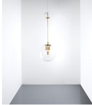
Doria Globe Pendant Lamps Large Pair Brass Clear Glass Lights, Germany 1970