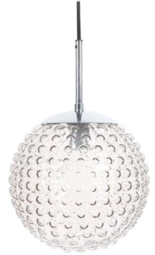
Staff 5x Bubble Glass Chrome Pendant Lamp, 1960