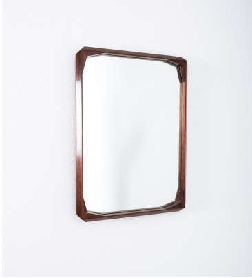
Dino Cavalli Walnut Mirror, Mid-century modern, Italy