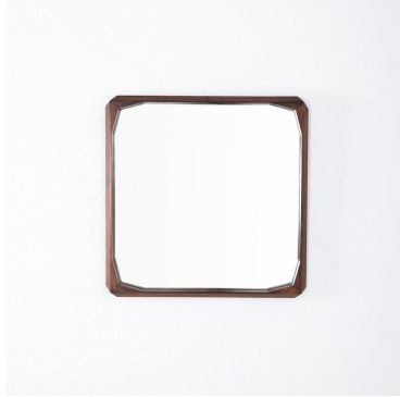
Dino Cavalli Walnut Mirror, Midcentury, Italy