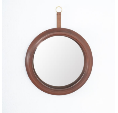
Walnut Wood Leather Wall Mirror, Midcentury, Italy