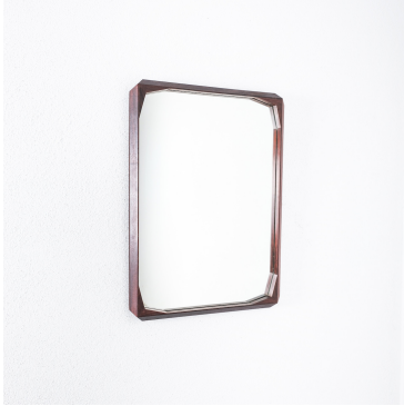
Dino Cavalli Walnut Mirror, Mid-century modern, Italy