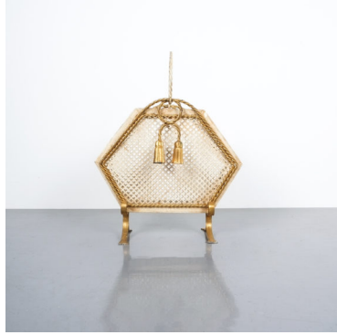
Wrought Iron Magazine Rack Gold White, Germany, circa 1955