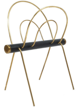
Austrian Brass Magazine Rack