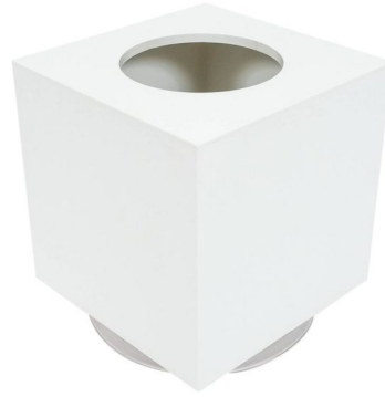
Cini & Nils White Cube Planter, Italy 1969