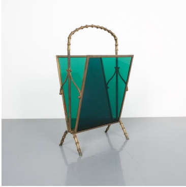
Maison Baguès Faux Bamboo Green Lucite Magazine Rack