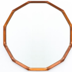
Dino Cavalli Walnut Mirror, Midcentury, Italy 1965