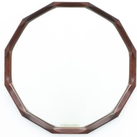
Dino Cavalli Walnut Mirror, 19.5" Midcentury, Italy 1965