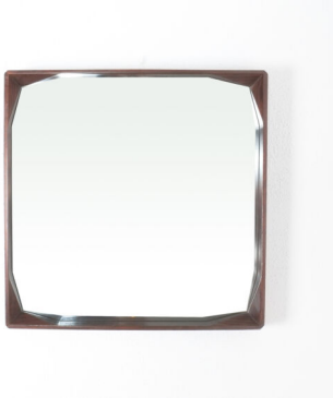
Dino Cavalli Walnut Mirror, Midcentury, Italy