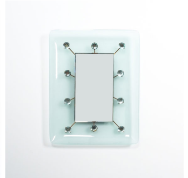
Max Ingrand Illuminated Fontana Arte Mirror, Italy, circa 1960