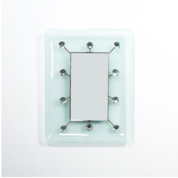
Max Ingrand Illuminated Fontana Arte Mirror, Italy, circa 1960