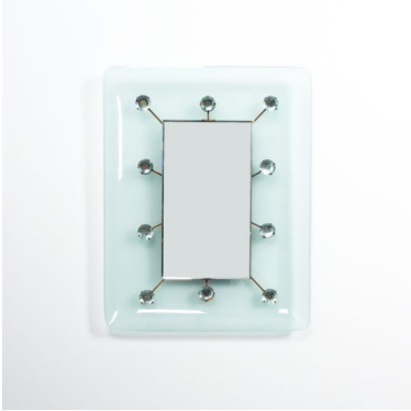
Max Ingrand Illuminated Fontana Arte Mirror, Italy, circa 1960