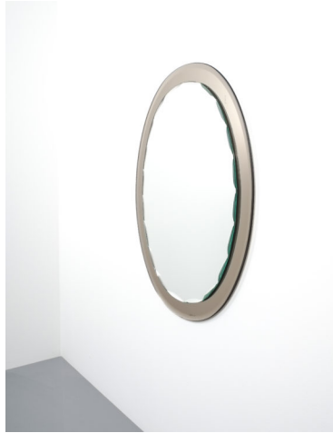
Fontana Arte Style Italian Scalloped Mirror, Italy 1960