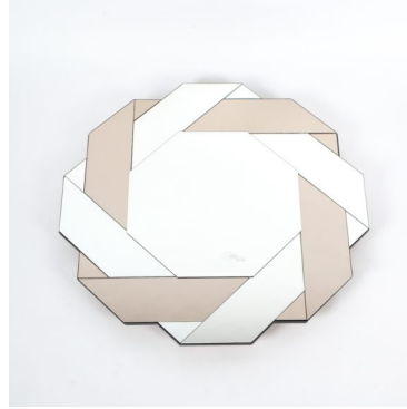
Hollywood Regency Bicolor Scalloped Large Italian Mirror