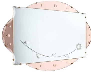
French Scalloped Duo Colored Glass Mirror