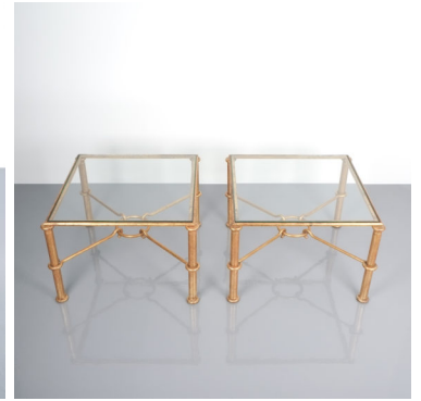
Rene Drouet att. Pair Gilt Iron Side Tables, France 1950