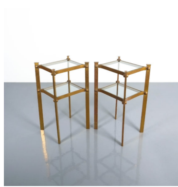
Cute Brass Side Tables With Glass Tops, France 1940