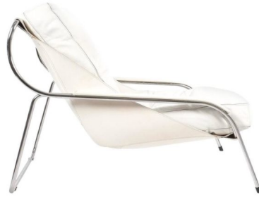
Marco Zanuso Maggiolina White Leather Chair by Zanotta, 1947