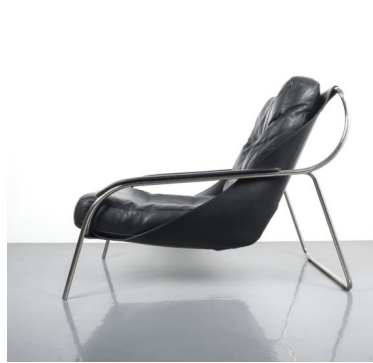
Marco Zanuso Maggiolina Sling Black Leather Chair by Zanotta, 1947