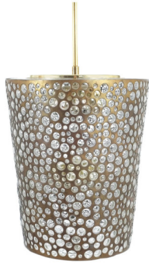
Limburg Bronze and Glass Pendant, 1960