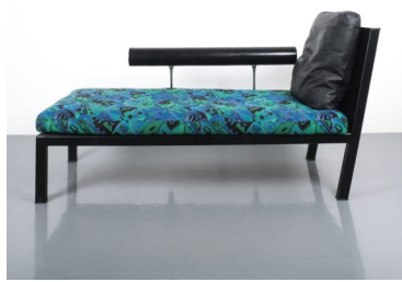
Antonio Citterio for B&B Italy Leather Chaise Lounge Baisity