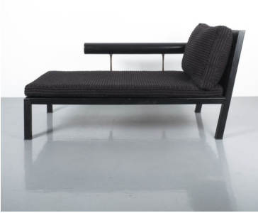
Antonio Citterio Chaise Lounge Sofa Baisity for B&B Italy