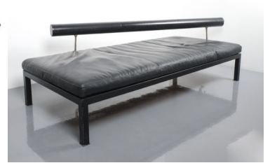
Antonio Citterio for B&B Italy Elegant Leather Daybed Sity, Italy, 1980