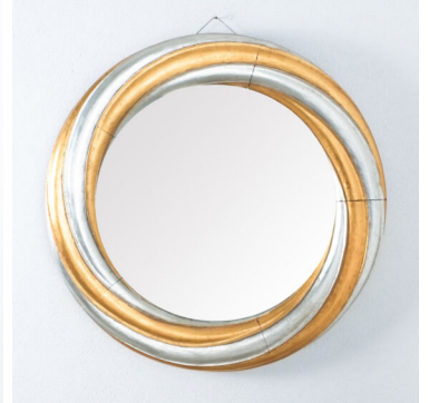
Trompe l'oeil Large Wood Swirl Wall Mirror, Italy 1910