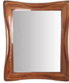
Walnut Wood Mirror, Midcentury, Italy