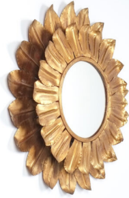
Sunburst Backlit Mirror Round Gold Leaf, France 1960