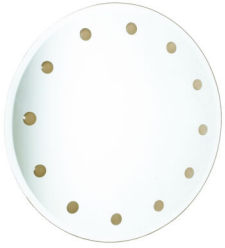
Sarfatti Attributed Round Illuminated Mirror, Italy, circa 1960