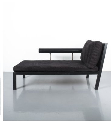
Antonio Citterio Chaise Lounge Sofa Baisity for B&B Italy