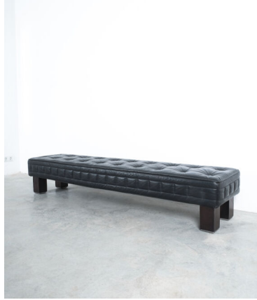
Matteo Thun One of Two Tufted Leather Banquettes Bench Materassi, Wittmann