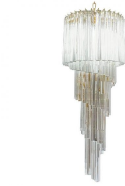
Venini Chandelier with Murano Prisms