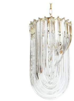
Venini Crystal Glass Gilt Brass Chandelier