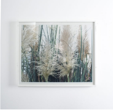
Annette Kelm Pampasgras Photography