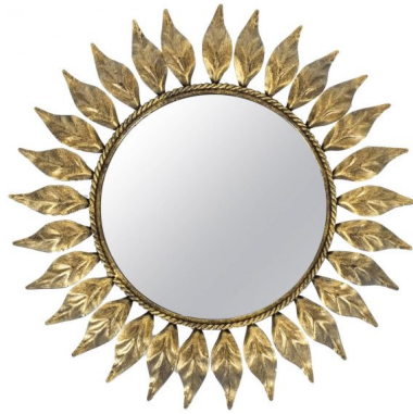
Sunburst Mirror Made From Patinized Brass