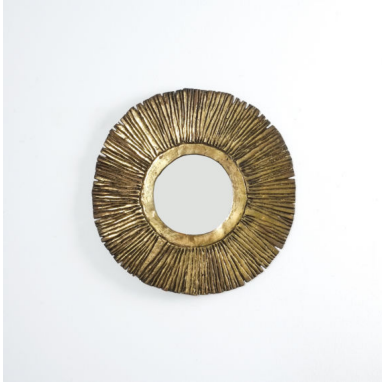
Sunburst Solid Brass Midcentury Mirror, France, circa 1955