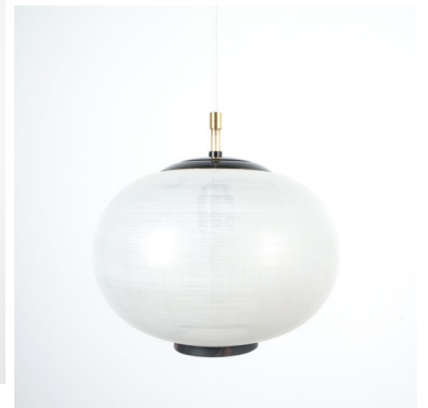
Stilnovo Satin Glass and Brass Pendant Lamp, Italy, 1950