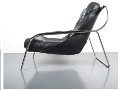
Marco Zanuso Maggiolina Sling Black Leather Chair by Zanotta, 1947