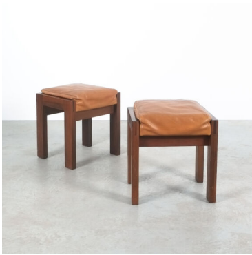
Maple and Leather Midcentury Wood Stools, Italy, 1950