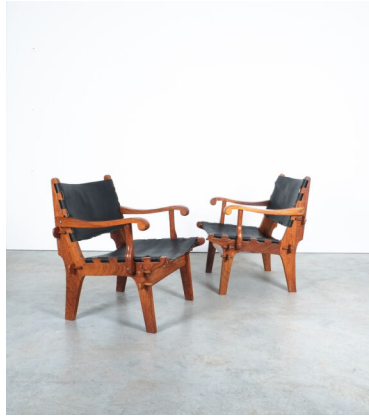
Angel Pazmino Safari Chairs Rosewood Hunting Armchairs Black Original Leather