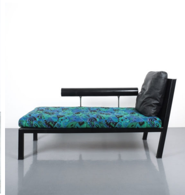
Antonio Citterio for B&B Italy Leather Chaise Lounge Baisity