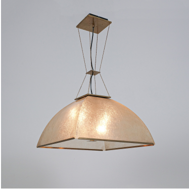
Salvatore Gregoriotti Chandelier in Fiberglass and Brass, circa 1970