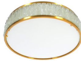
Jean Perzel 3 Large Art Deco Brass and Glass Flush Mounts