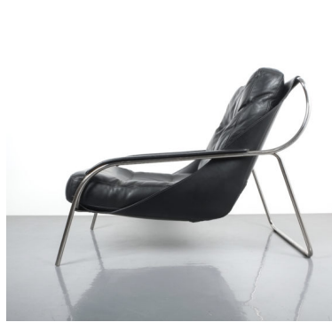
Marco Zanuso Maggiolina Sling Black Leather Chair by Zanotta, 1947