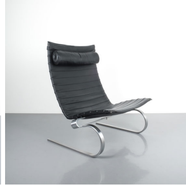
Poul Kjaerholm Early Fritz Hansen PK20 Lounge Chair in Black Leather, 1987