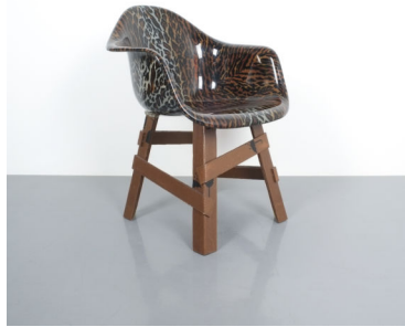
Eames Appropriation Dining Armchair with Polished Resin Leopard Seat