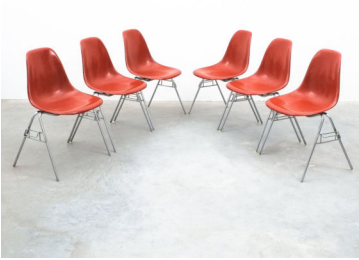
Eames Six Rare Herman Miller Dining Chairs Terracotta, circa 1970