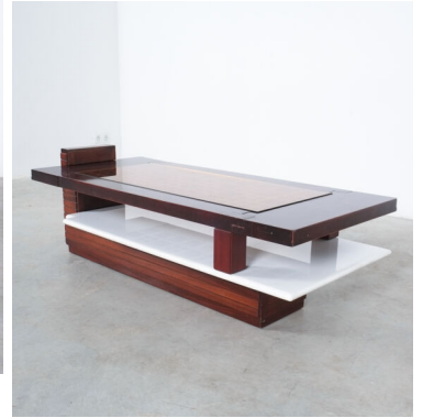
Rosewood Coffee Table with Marble Tray, Circa 1970