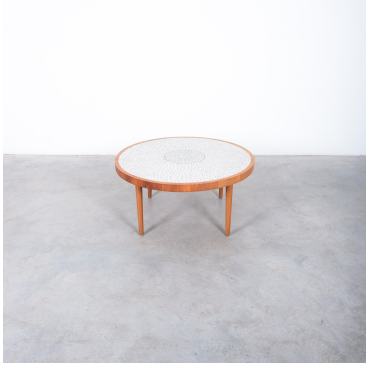
Walnut Wood Mosaic Coffee Table, France, circa 1960