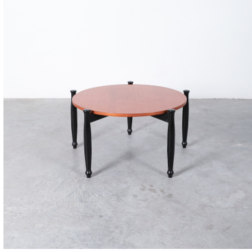
Ilmari Tapiovaara Round Walnut Teak Wood Coffee Table, circa 1960