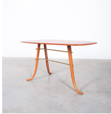
Gio Ponti Coffee or Side Boomerang Table Style Gio Ponti Wood, Italy, circa 1955