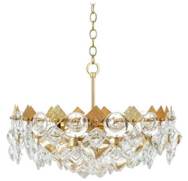
Palwa Gilt Brass and Glass Chandelier /DERIVE