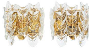
Gilt Brass and Glass Sconces by Palwa