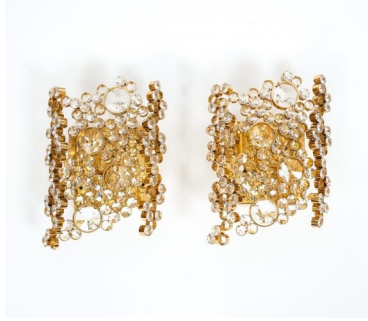
Palwa Pair of Gilt Brass and Crystal Glass Encrusted Sconces