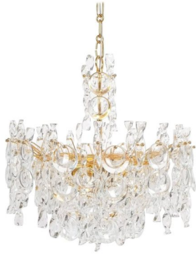
Palwa Tendril Ribbon Glass Gold Chandelier, 1960