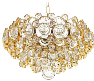
Palwa Gilt Brass Glass Chandelier 20", Germany circa 1965