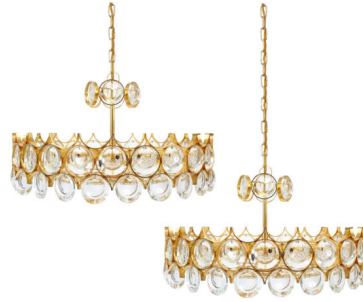
Palwa Pair of Gilt Brass Glass Chandeliers 22"