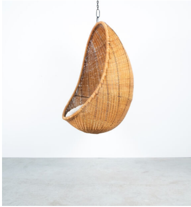
Nanna Ditzel Egg-Shaped Hanging Cane Chair, Italy 1959