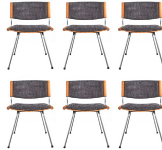
Nanna Ditzel Set of 6 Badminton ND 150 Dining Chairs for Kolds Savvaerk