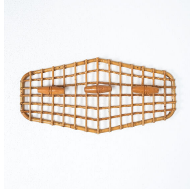
Olaf von Bohr Bamboo Coatrack with 3 Hooks, Italy Midcentury