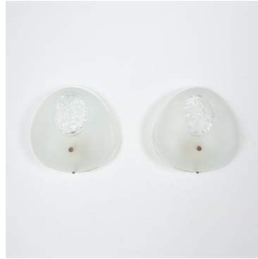
Max Ingrand for Fontana Arte, Pair of Chiseled Thick Glass Sconces, Italy, 1960