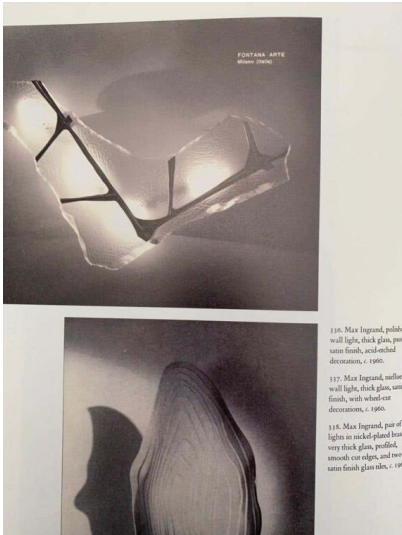
116. Max Ingrand, polished wall light, thick glass, patina finish, acid-etched decoration, c. 1960. 117. Max Ingrand, mother wall light, thick glass, satin finish, with wheel-cut decoration, c. 1960. 118. Max Ingrand, pair of lights in nickel-plated brass, very thick glass, polished, smooth cut edges, and satin finish glass ribs, c. 1960.