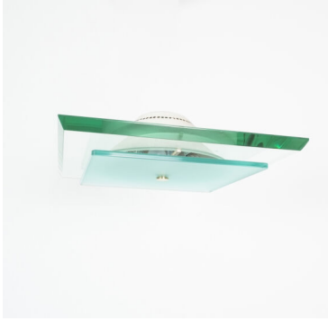
Max Ingrand Large Fontana Arte Flush Mount Model 1990