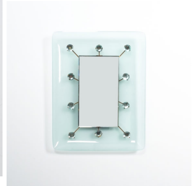
Max Ingrand Illuminated Fontana Arte Mirror, Italy, circa 1960