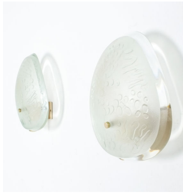
Max Ingrand for Fontana Arte Pair of Thick Glass Sconces, Italy, 1960