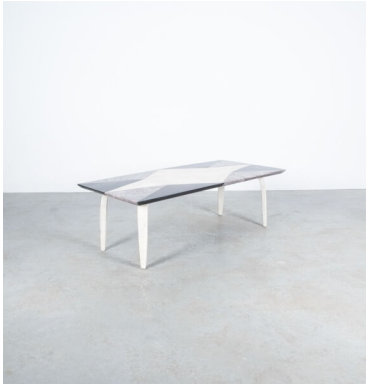
Marble Side Table From Mosaic Tiles, Italy, circa 1970