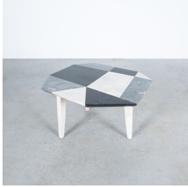
Marble Side Table From Mosaic Tiles, Italy, circa 1970