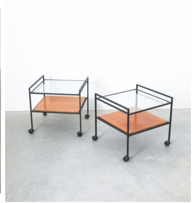
Side Tables Pair of Glass Wood Iron Tables, Italy, 1960